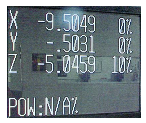
Figure 22-1 Full position display during manual mode (Jog)

Each of the axes position can be zero while in this mode. By pressing the associated letter for the axis, the position display will be zeroed out. For example, pressing the Y key will result in the Y axis position to be cleared to zero. This feature can be helpful to set reference points as the machine is positioned to points on a part print.