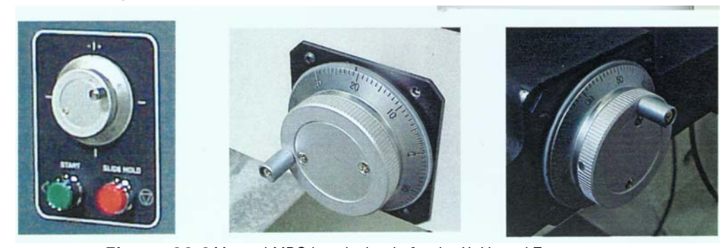
Figure 22-2 Manual MPG hand wheels for the X, Y, and Z axes